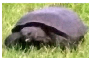
Photo credits: 1. Hooded Merganser, David Brubaker; 2. Sandhill Cranes, 4. Ratsnake with rat, and 5. Gopher Tortoise, Bill Uttenweiler; 3. Wood Stork, Bob Bishopric