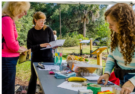
NMIHOA members distributed information and answered current questions about NMI.