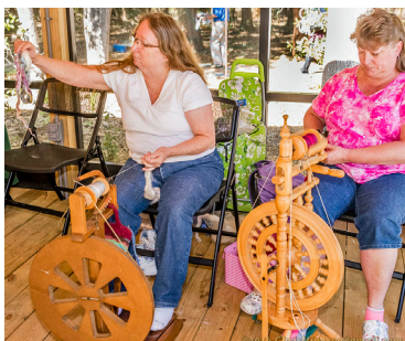
Five spinners demonstrated the art of spinning wool.