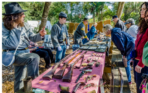
Confederate soldiers display weapons and related historic memorabilia.