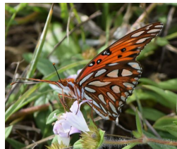
Gulf Fritillary butterfly

You don't need a photo to submit a sighting. If you saw animal in the wild on NMI, we'd love to hear about it. Send us the date, time, species, and location where spotted.