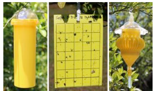
Two 3D printed psyllid traps alongside a standard yellow sticky card.

This type of testing and analysis gives researchers better methods and materials for faster response times in the management of Asian citrus psyllids which carry the bacterium associated with Huanglongbing or citrus greening disease. Capturing and testing psyllids has been a challenge because standard practices of yellow sticky cards to capture psyllids are messy and catch other insects as well. Traps are modeled with design software and printed on commercially available 3D printers and those with the highest success are chosen for field testing. - D. Hunt