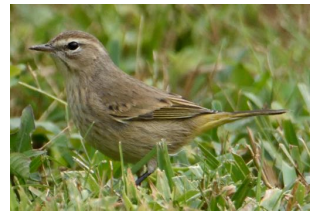
Palm Warbler