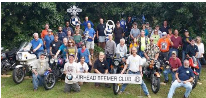
Airhead Beemer Club poses during NMI Rally.